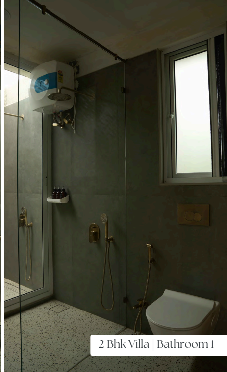
2 Bhk Villa | Bathroom 1