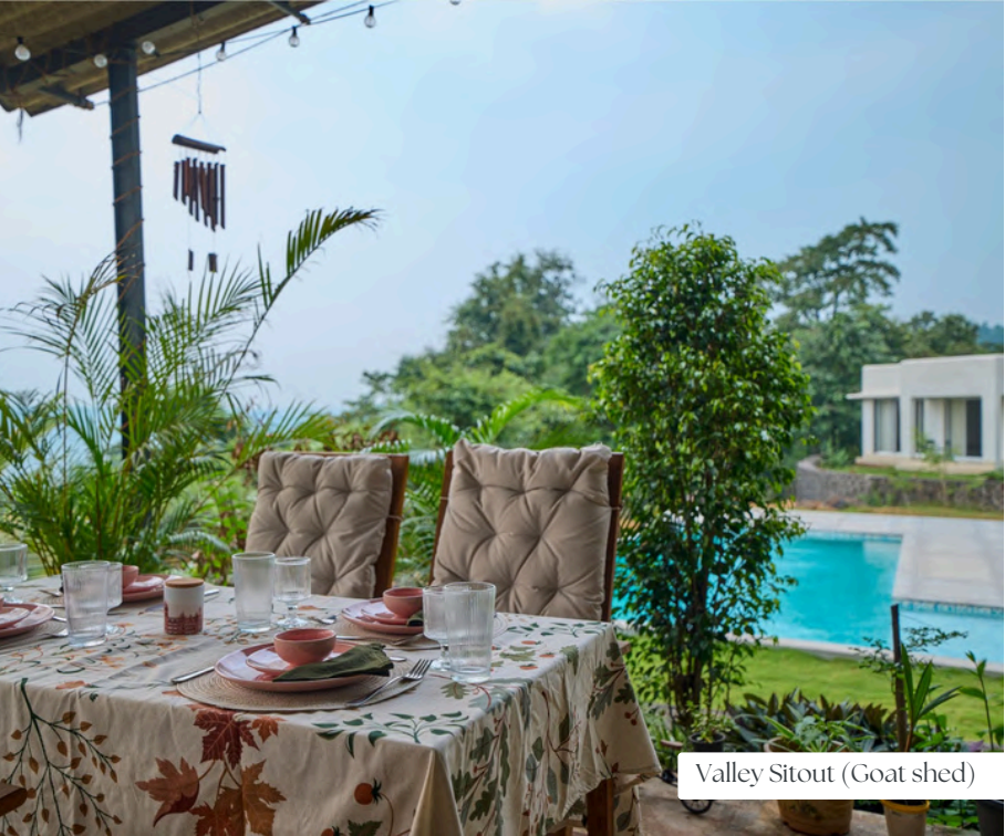
Valley Sitout (Goat shed)