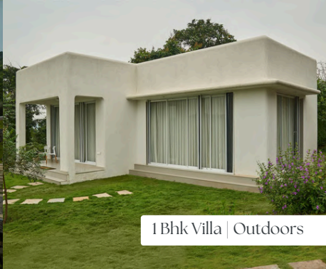
1 Bhk Villa | Outdoors