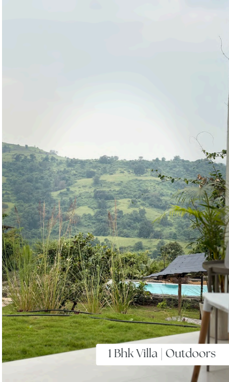
1 Bhk Villa | Outdoors