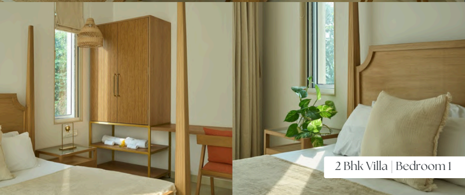
2 Bhk Villa | Bedroom 1