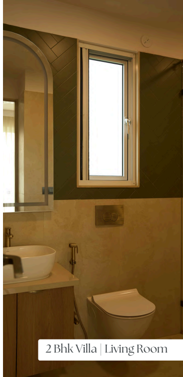
2 Bhk Villa | Living Room