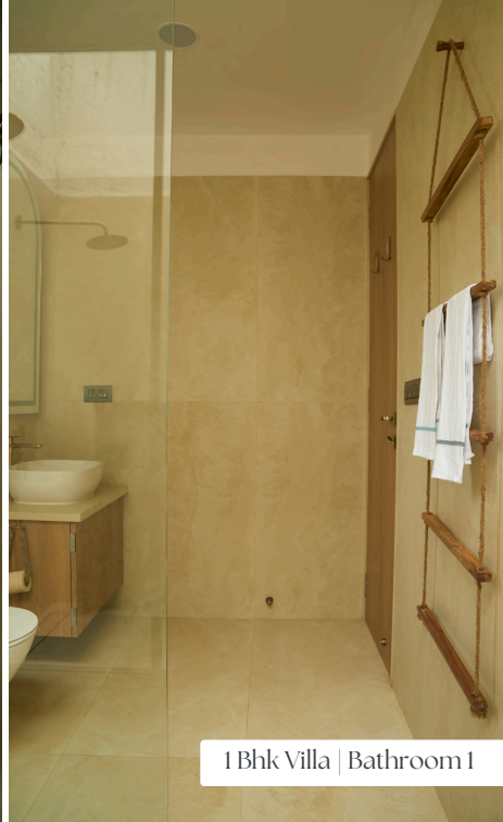
1 Bhk Villa | Bathroom 1