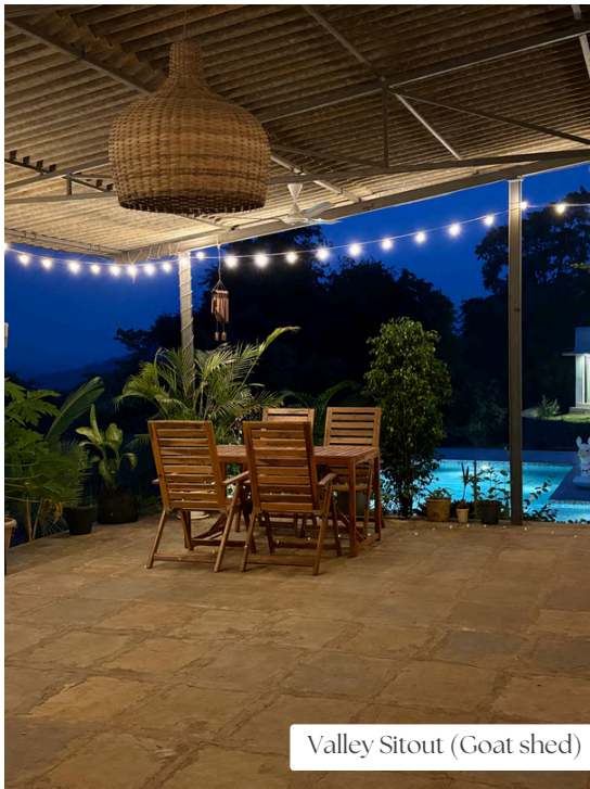
Valley Sitout (Goat shed)