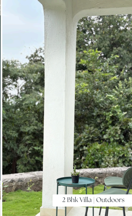
2 Bhk Villa | Outdoors