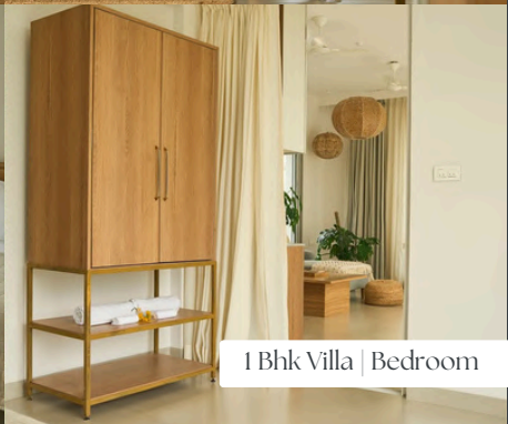
1 Bhk Villa | Bedroom