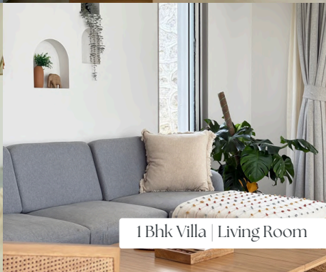
1 Bhk Villa | Living Room